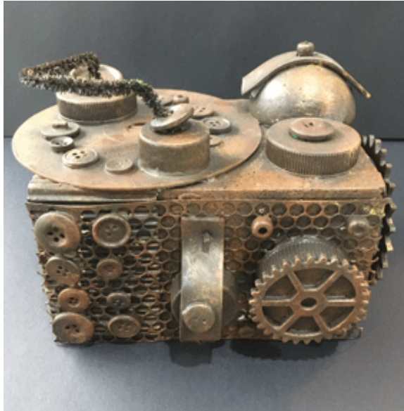
Left: Diversity and Disability exhibition.